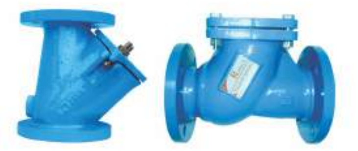
5100 Series (Flanged)

3106 Series Boll check values are supplied with WPT threaded and coenections, ideally designed to prevent undesired hockward flow. The values are supplied cost total body spany started and response rabble boll.