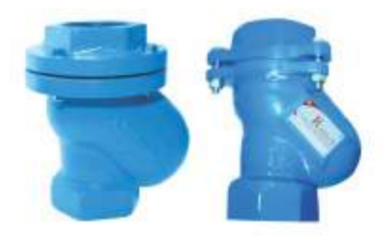
3100 Series (MPT Threaded)

3106 Series Boll check values are supplied with WPT threaded and coenections, ideally designed to prevent undesired hockward flow. The values are supplied cost total body spany started and response rabble boll.